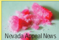
Nevada Appeal News