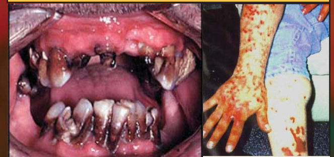
Meth mouth and "crank bugs" (sores) are long term symptoms of a methamphetamine user.